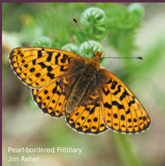
Pearl-bordered Fritillary Jim Asher

The Marsh Fritillary can be found in Dartmoor's wet valleys and mires, nectaring on orchids, bog bean and other wetland plants, and gliding gracefully among Devil's-bit scabious plants in search of egg-laying spots.