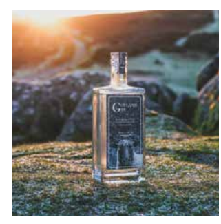
3. Gotland Gin