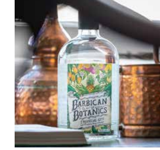
15. Devon Distillery