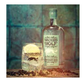
1. Wicked Wolf Gin