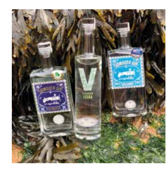
5. Sidmouth Gin