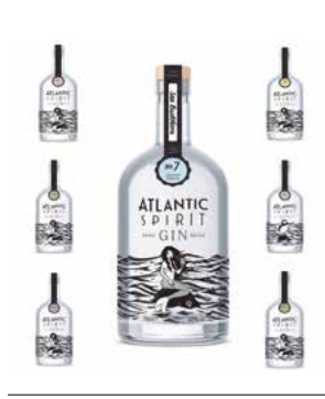
2. Atlantic Spirit Gin