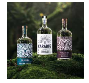
6. Papillon Gin