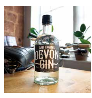
4. Bad Fagin's Devon Gin